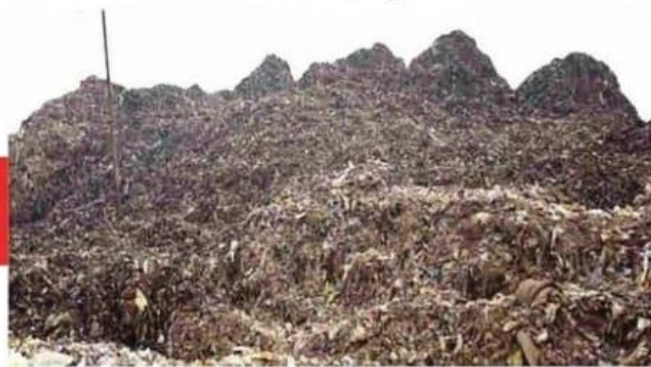
लोहिया नगर में लगा कूड़े का पहाड़।

डीएम ने जांच के आदेश दिए, नगर आयुक्त ने नगर निगम अधिकारियों को फटकार लगाई, कूड़ा निस्तारण के निर्देश