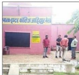
स्कूल में जांच करने पहुंची टीम।